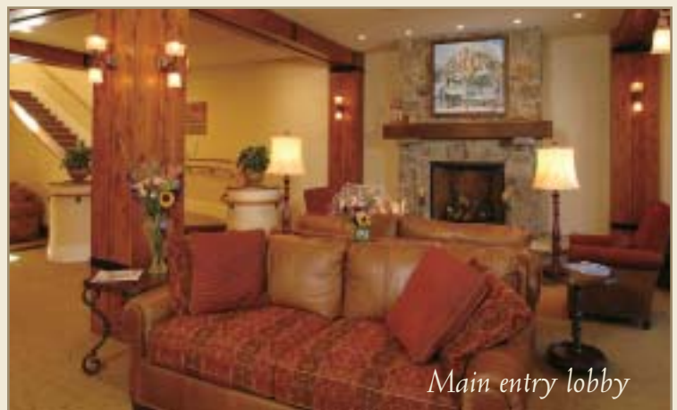
Main entry lobby