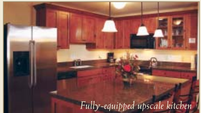
Fully-equipped upscale kitchen