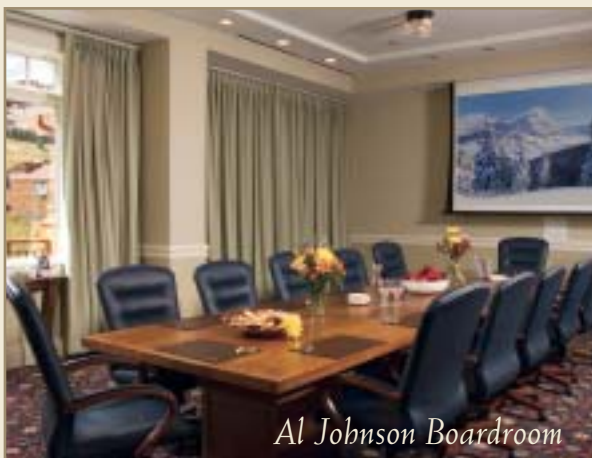
Al Johnson Boardroom