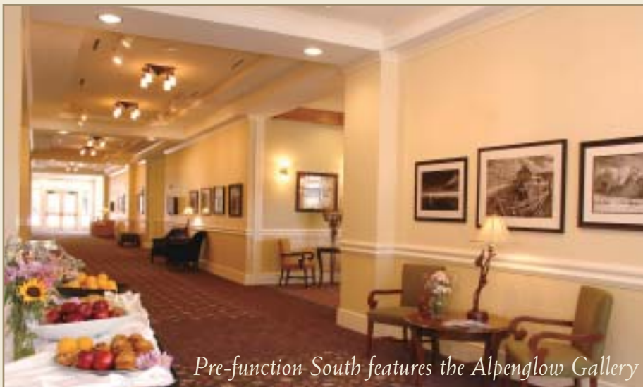
Pre-function South features the Alpenglow Gallery

Relax in front of the fireplace and enjoy a drink from our selection of high-end whiskeys and wines with friends or associates. Trackers Bar & Lounge can also be used for informal gatherings.