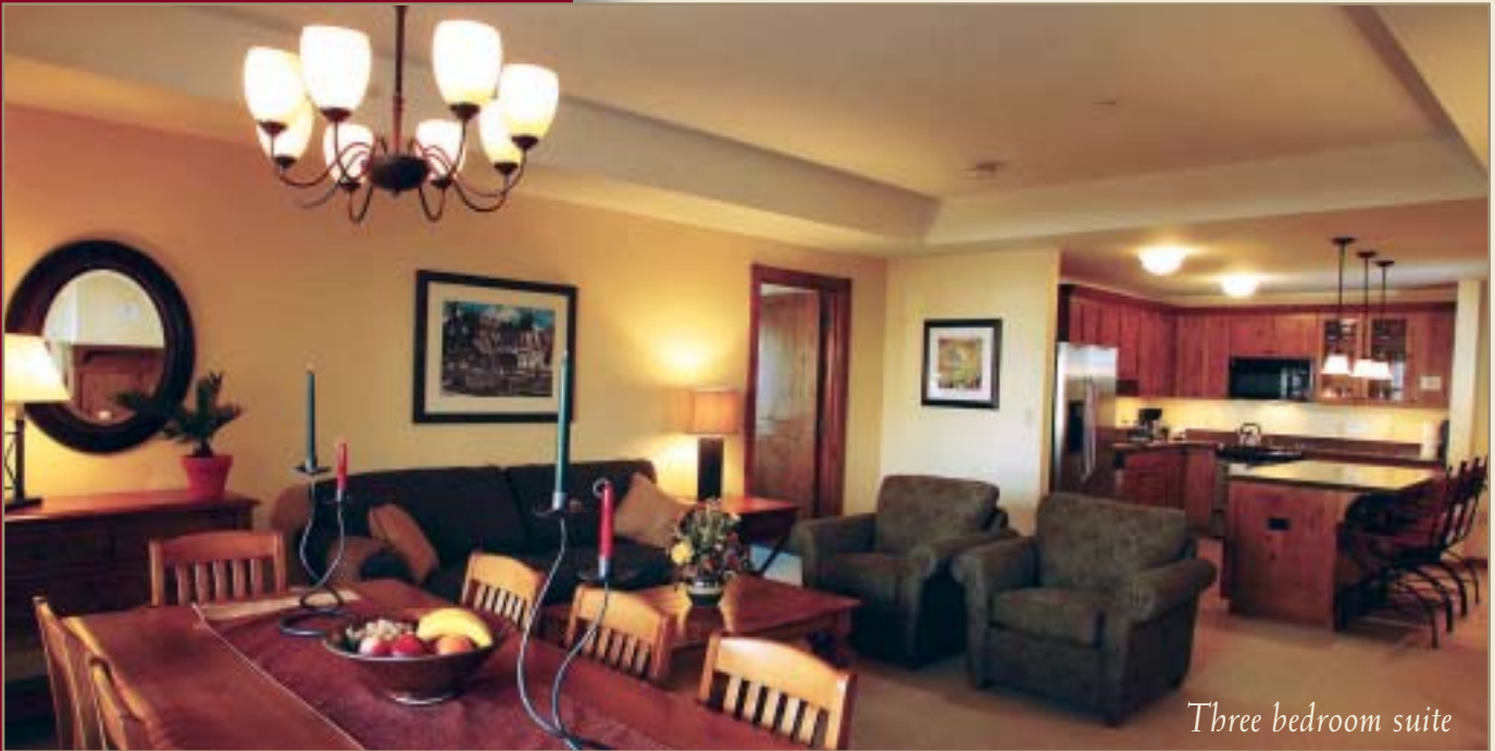
Three bedroom suite

STUDIO UNITS include all of the amenities of the larger units but are complemented with Galley kitchens that contain a microwave, under counter refrigerator, dishwasher and two burner stove top.