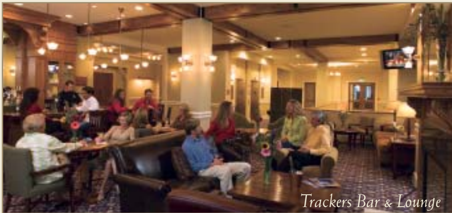
Trackers Bar & Lounge